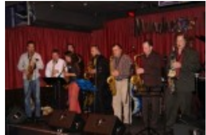
Sponsored and organized by The Music Place 339 Clarendon Street, South Melbourne. www.musicplace.com.au